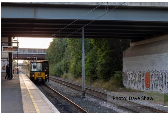
A Metro pauses at Northumberland Park on its way to the Coast. The proposed Northumberland Line platform would be where the trees now stand to the left of the graffiti.

https://northeastca.gov.uk/decision-making/the-north-east-joint-transport-committee/