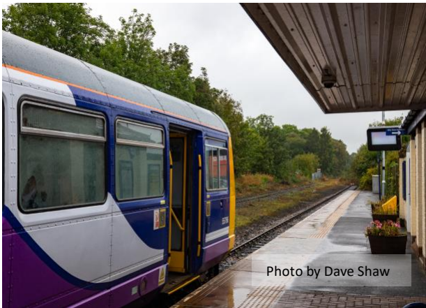
End of the line for this Pacer. If we want to go further up Weardale by train it is a ten minute walk to a completely separate platform. Would it not be nice if the two companies could work out how to share a single station?

We settle down by the window of a Pacer at Darlington, and a few moments later we arrive at North Road. Now just a halt this was once the home of a large railway works, building many of the locomotives used in the North East. The Head of Steam Museum sits beside the